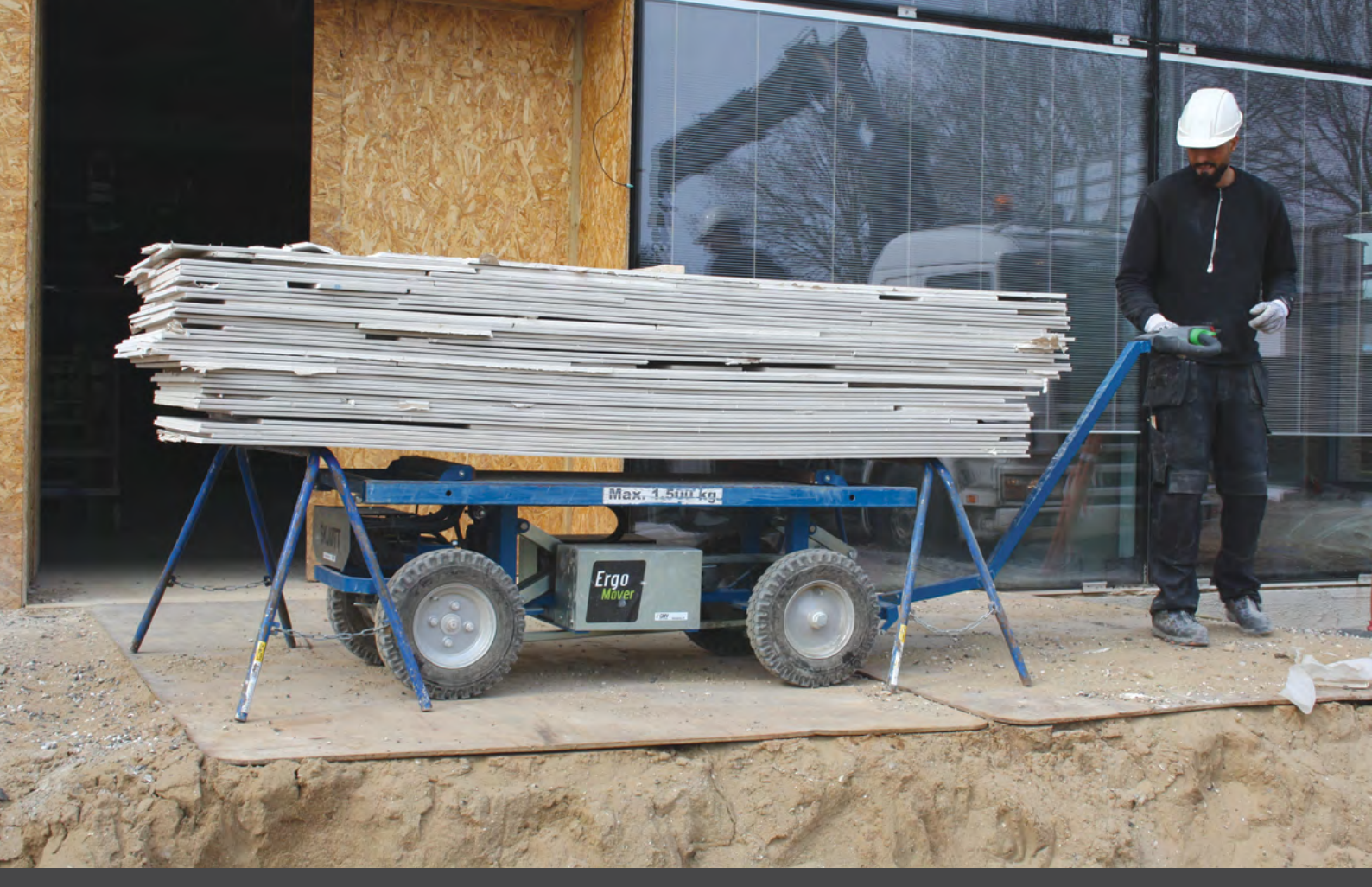
The ErgoMover Lift and Go can lift the platform 150mm, ideal for placing plasterboards on to trestles